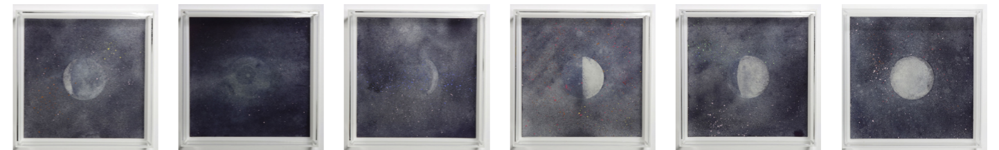
*Waning Crescent $250 *New Moon $250 *Waxing Crescent $250 *First quarter $250 *Waxing Gibbous $250 *Full moon #3 $250