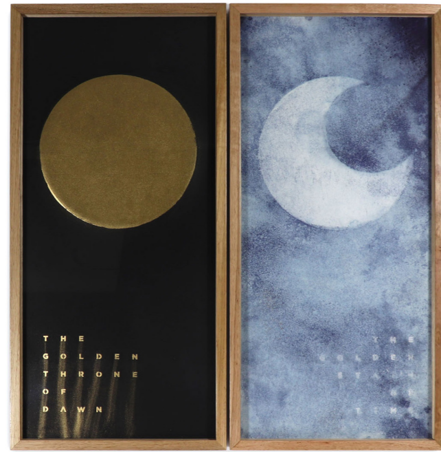
Moon phases series* Jessie Stanley 2022 Synthetic indigo, water, various enamel powders on cotton vellum, acrylic. Each 30x30x8.5cm *Full moon #1 $250