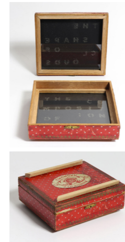
The Composition of Air Jessie Stanley 2022 Cigarette ash on cotton vellum, found cigar box, glass, Tasmanian Oak. 15x28cm $375