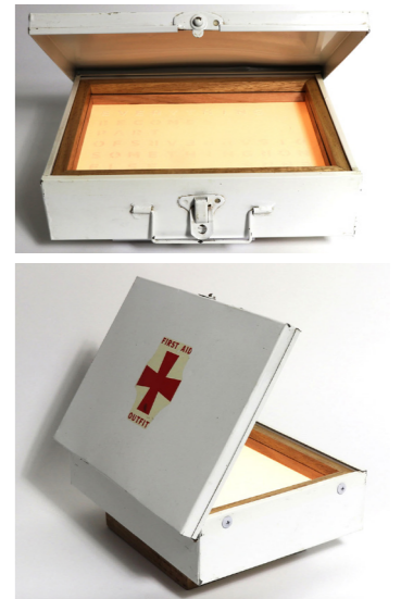
Everything and Nothing Jessie Stanley 2022 Dragon bone powder (os draconis) on cotton vellum, found first aid box, opal acrylic, glass, battery operated LED, Tasmanian Oak. 27x21x7cm $580