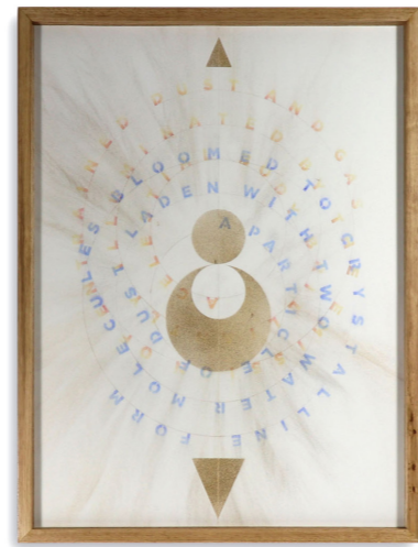
Realms Invisible to the Living Jessie Stanley 2022 Pastel dust, gold bronze letterpress powder, cotton vellum, glass, Tasmanian Oak. 59.5x77cm $950