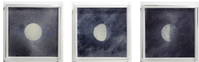
*Full moon #2 $250 *Waning Gibbous $250 *Third Quarter $250