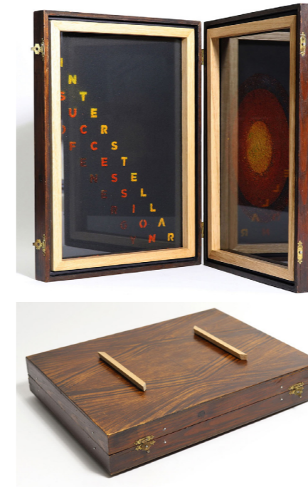
Photosynthesis Jessie Stanley 2022 Ground spices (turmeric, sweet paprika, smoked paprika, sumac) on cotton vellum, found Sheffield cutlery box, glass, Tasmanian Oak. 47x32cm $650